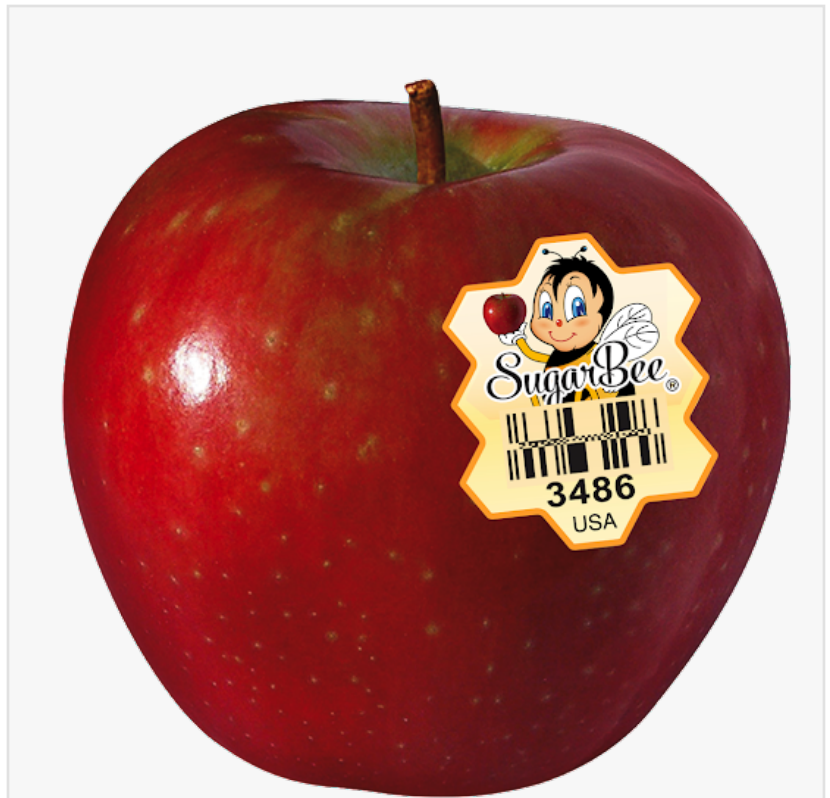
A ripe SugarBee apple with honeycomb-shaped PLU sticker

Julie DeJarnatt Chelan Fresh +1 509-682-4252 julied@chelanfresh.com Visit us on social media: